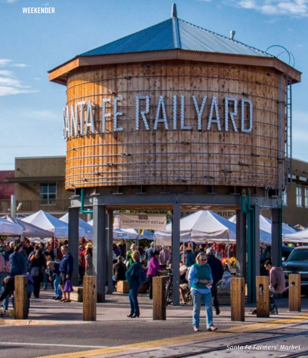
Santa Fe Farmers' Market